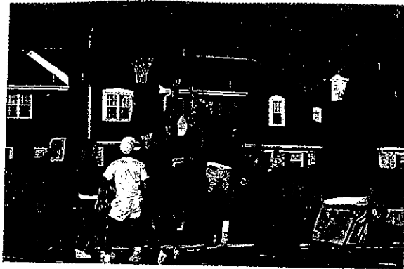
Jumping and running take energy.